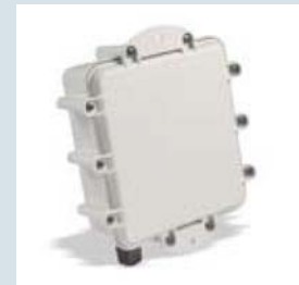
48V Transformer and Power Surge Protector AP-PSBIAS-5181-01R

Not Shown: Wall Pole and Mounting Kit KT-5181-WP-01R