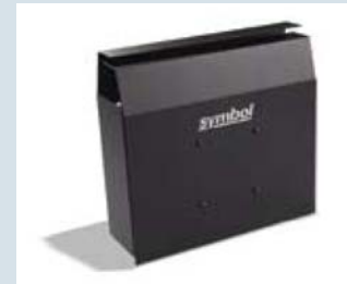
Heavy Weather Kit KT-5181-HW-01R