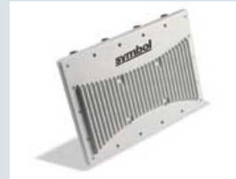
AP-5181 Dual Radio AP AP-5181-13040-WWR